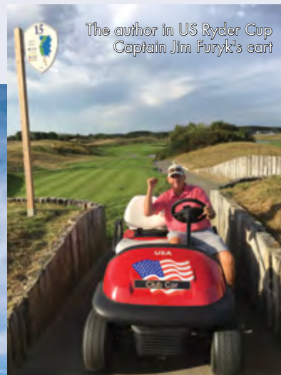
The author in US Ryder Cup Captain Jim Furyk's cart