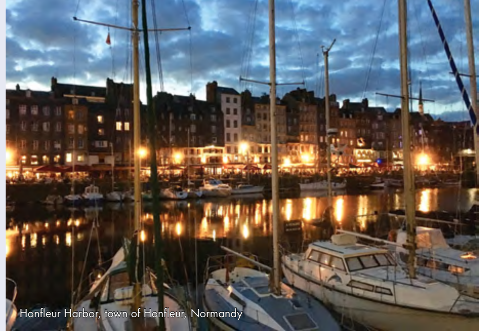
Honfleur Harbor, town of Honfleur, Normandy

As great as the golf is in this region, all Americans need to set aside a few hours of their trip to visit Normandy. Stroll the sands of Omaha Beach and you can still feel the history and turmoil that took place here on June 6, 1944. At Pointe Du Hoc, many remnants of World War II can still be found.