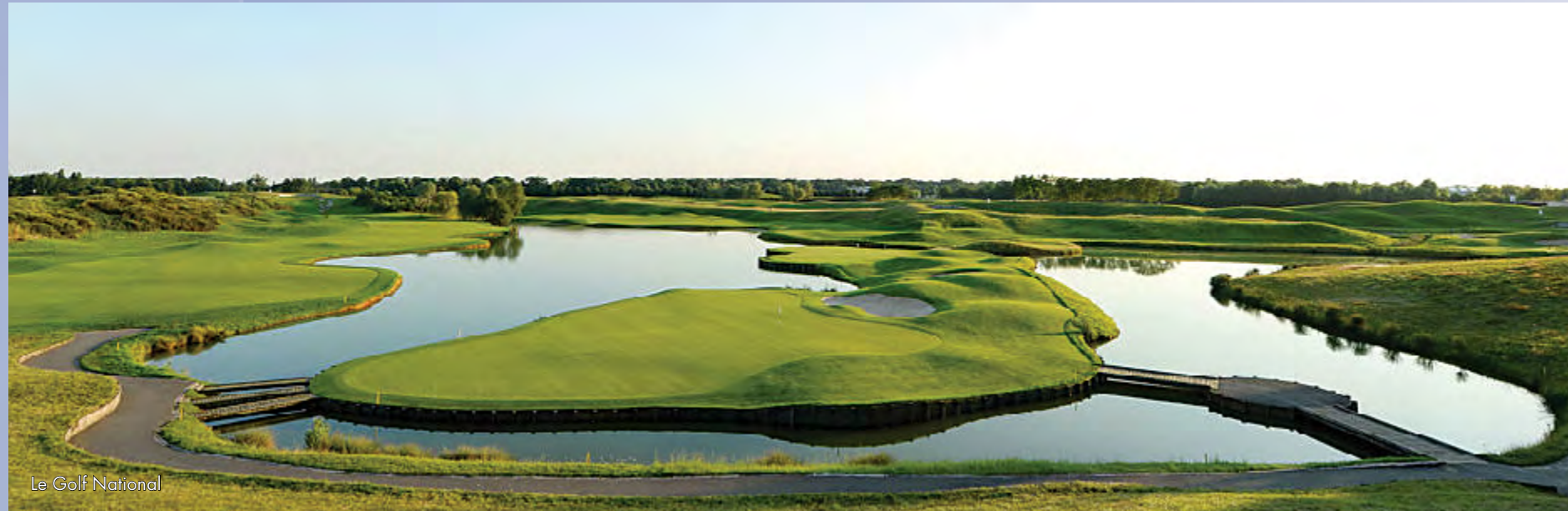
Le Golf National