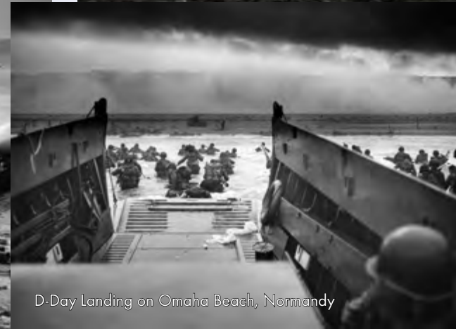
D-Day Landing on Omaha Beach, Normandy