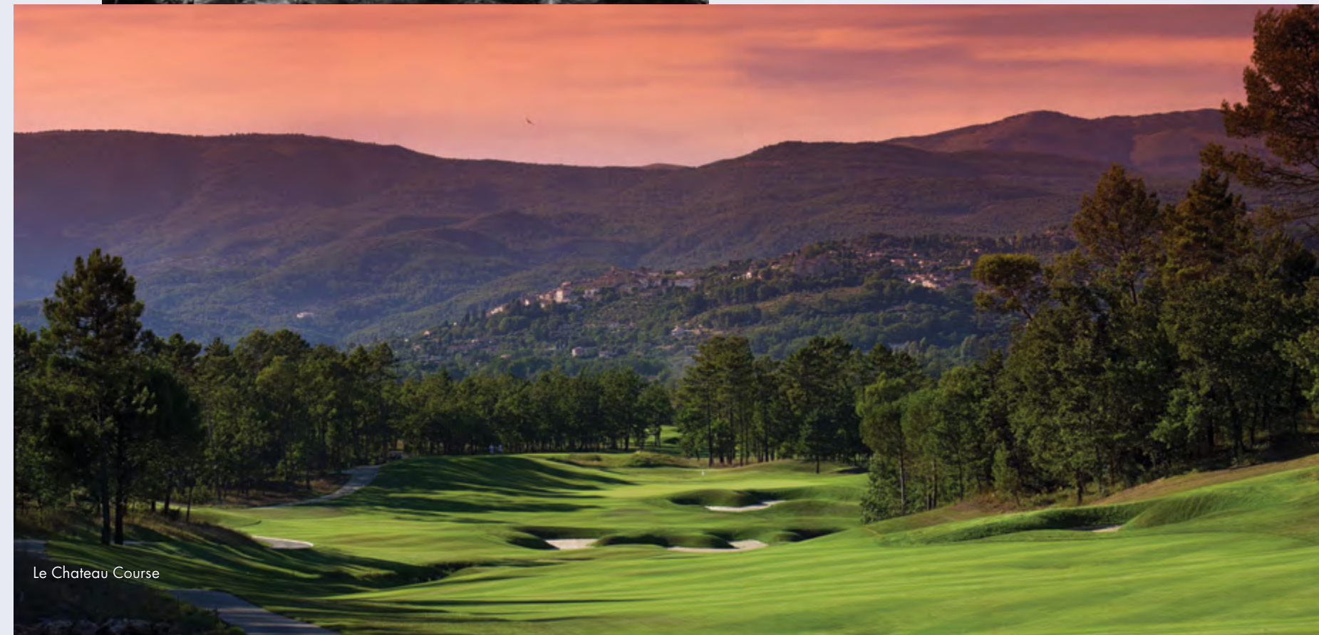
Le Chateau Course