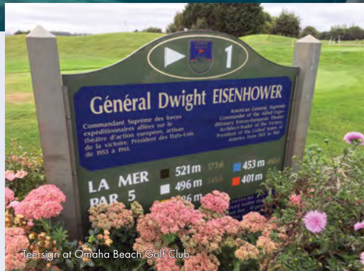
Tee sign at Omaha Beach Golf Club

yards long and features fairways with significant drops and greens that will test your stroke. This course was a joy to play and not as testy as Le Chateau. The par-4 ninth hole stands out, playing uphill with a waterfall and a pond along the right side. The par-5 18th starts with a tee set high on a plateau playing down to brilliant water features along the entire right side, making it an ideal and scenic risk-reward finishing hole.