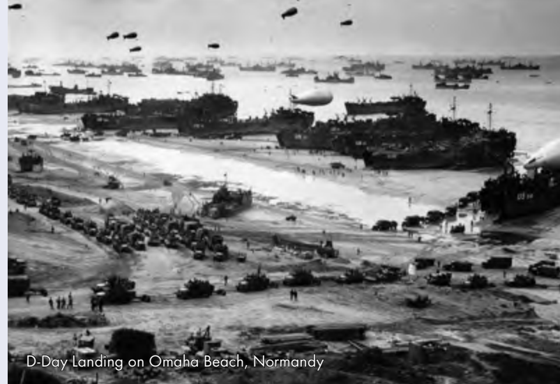
D-Day Landing on Omaha Beach, Normandy